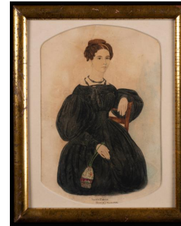
Title: Nancy Couch Date: 1836 Primary Maker: Henry Walton Medium: Watercolor and ink on heavy wove paper