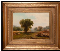
Title: Landscape With Sheep Date: 1858 Primary Maker: George Inness Medium: Oil on board