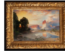
Title: Afterglow, Green River, Wyoming Date: 1918 Primary Maker: Thomas Moran Medium: Oil on canvas