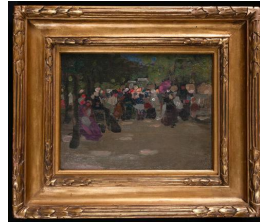
Title: Luxembourg Gardens---Sketch Date: c. 1901 Primary Maker: Frederick Carl Frieseke Medium: Oil on board