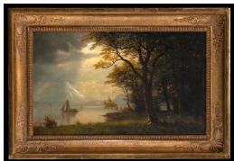
Title: Mount Hood, Columbia River Date: 1870 Primary Maker: Albert Bierstadt Medium: Oil on panel