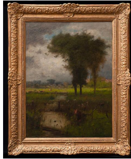
Title: Summer, Montclair Date: 1887 Primary Maker: George Inness Medium: Oil on canvas