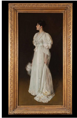
Title: The Lady in White Date: 1894 Primary Maker: William Merritt Chase Medium: Oil on canvas