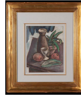
Title: Still Life with Fruit, Vase, and Cup Date: 1910 Primary Maker: Max Weber Medium: Pastel on paper laid down on heavy card