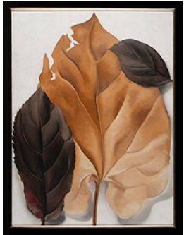
Title: Brown and Tan Leaves Date: 1928 Primary Maker: Georgia O'Keeffe Medium: Oil on canvas