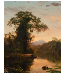
Title: South American Landscape Date: c. 1856 Primary Maker: Frederic Edwin Church Medium: Oil on canvas