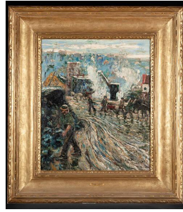
Title: Building the New York Subway Date: c. 1904 - 1909 Primary Maker: Ernest Lawson Medium: Oil on canvas