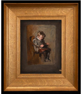
Title: Seated Boy with Book (on verso: Baby Girl Playing) Date: ca. 1876 Primary Maker: Thomas Eakins Medium: Oil on board