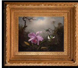
Title: Cattleya Orchid with Two Brazilian Hummingbirds Date: 1871 Primary Maker: Martin Johnson Heade Medium: Oil on panel