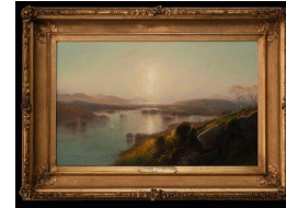
Title: Morning Date: 1859 Primary Maker: Samuel Colman Medium: Oil on canvas