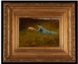
Title: The Pet Lamb Date: 1873 Primary Maker: Eastman Johnson Medium: Oil on board