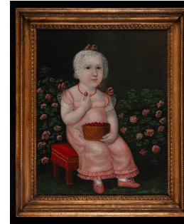
Title: Seated Girl With Strawberries Date: 1803-1805 Primary Maker: Joshua Johnson Medium: Oil on canvas