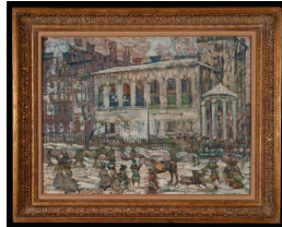
Title: Snowy Day, Boston Date: 1907-1910 Primary Maker: Maurice Brazil Prendergast Medium: Oil on canvas