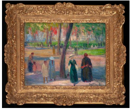
Title: Washington Square---The Green Dress Date: c. 1910 Primary Maker: William Glackens Medium: Oil on canvas