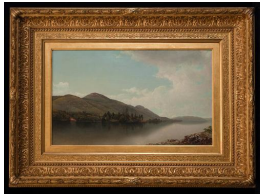
Title: Buck Mountain, Lake George Date: 1872 Primary Maker: David Johnson Medium: Oil on canvas