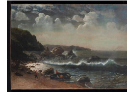
Title: The Golden Gate Date: c. 1872 Primary Maker: Albert Bierstadt Medium: Oil on canvas