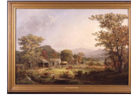
Title: Cider Making in the Country Date: 1863 Primary Maker: George Henry Durrie Medium: Oil on canvas