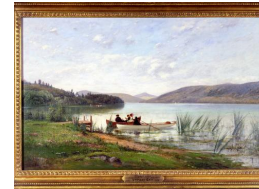
Title: Otsego Lake Looking North from Two Mile Point Date: ca.1882 Primary Maker: Edward B. Gay Medium: Oil on canvas