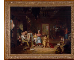
Title: The Itinerant Artist Date: c. 1850 Primary Maker: Charles Bird King Medium: Oil on canvas