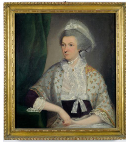
Title: Abigail Adams Date: c. 1795 Primary Maker: Ralph Earl Medium: Oil on canvas