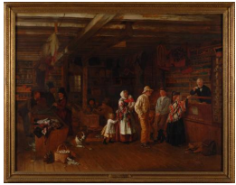
Title: Village Post Office Date: 1873 Primary Maker: Thomas Waterman Wood Medium: Oil on canvas