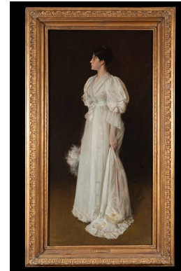
Title: The Lady in White Date: 1894 Primary Maker: William Merritt Chase Medium: Oil on canvas