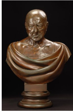
Title: John Adams (1735-1826)