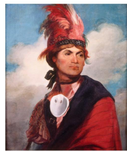
Title: Joseph Brant Date: 1786 Primary Maker: Gilbert Stuart Medium: Oil on canvas