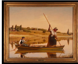
Title: Eel Spearing at Setauket Date: 1845 Primary Maker: William Sidney Mount Medium: Oil on canvas