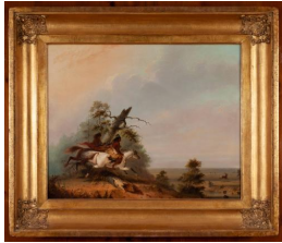
Title: Indians Hunting Elk Date: 1837 Primary Maker: Alfred Jacob Miller Medium: Oil on canvas