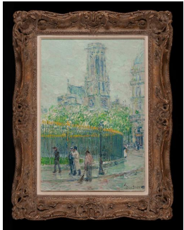
Title: St Germaine l'Auxerrois Date: 1897 Primary Maker: Childe Hassam Medium: Oil on canvas