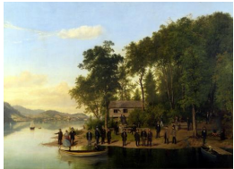
Title: Lake Party at Three Mile Point, Otsego Lake, New York Date: c. 1855 Primary Maker: Julius Gollmann Medium: Oil on canvas