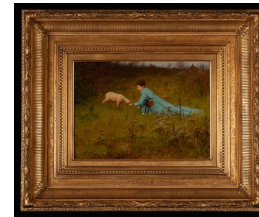
Title: The Pet Lamb Date: 1873 Primary Maker: Eastman Johnson Medium: Oil on board