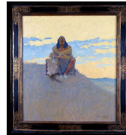
Title: When His Heart is Bad Date: 1908 Primary Maker: Frederic Remington Medium: Oil on canvas