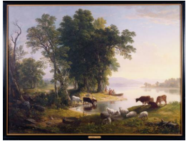
Title: Hudson River Looking Toward the Catskills Date: 1847 Primary Maker: Asher Brown Durand Medium: Oil on canvas