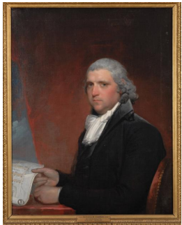
Title: William Cooper (1754-1809) Date: 1794-1797 Primary Maker: Gilbert Stuart Medium: Oil on canvas