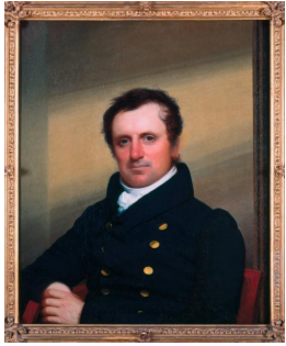
Title: James Fenimore Cooper (1789-1851) Date: 1822 Primary Maker: John Wesley Jarvis Medium: Oil on canvas