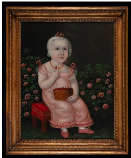
Title: Seated Girl With Strawberries Date: 1803-1805 Primary Maker: Joshua Johnson Medium: Oil on canvas