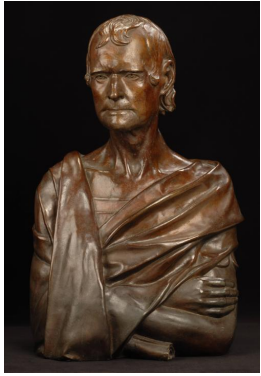
Title: Thomas Jefferson (1743-1826)