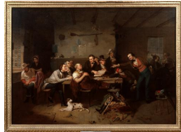
Title: Justice's Court in the Back Woods Date: 1850 Primary Maker: Tompkins Harrison Matteson Medium: Oil on canvas