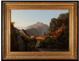
Title: Landscape Scene from "The Last of the Mohicans" Date: 1827 Primary Maker: Thomas Cole Medium: Oil on canvas