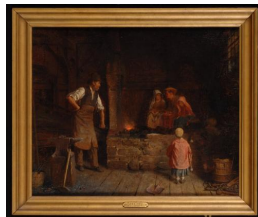
Title: The Blacksmith Shop Date: 1863 Primary Maker: Eastman Johnson Medium: Oil on canvas