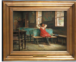
Title: Kept In Date: 1889 Primary Maker: Edward Lamson Henry Medium: Oil on canvas