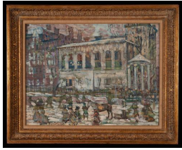
Title: Snowy Day, Boston Date: 1907-1910 Primary Maker: Maurice Brazil Prendergast Medium: Oil on canvas