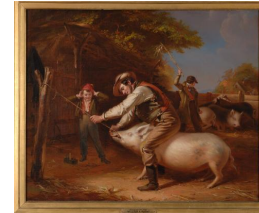
Title: Ringing the Pig Date: 1842 Primary Maker: William Sidney Mount Medium: Oil on canvas