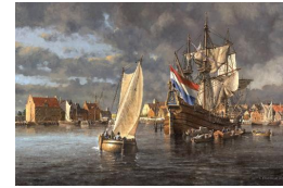
Title: On the East River, Manhattan, circa 1655 Date: 2015 Primary Maker: Len F. Tantillo Medium: Oil on canvas