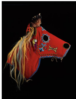
Title: Horse Mask Date: 1875-1900 Primary Maker: Nez Perce Medium: Woolen cloth, cotton, glass beads, brass button, dyed horsehair, silk ribbons, feathers, brass-framed mirror, hide, cotton thread, ermine