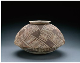
Title: Jar Date: 900-1100 Primary Maker: Hohokam Medium: Clay, organic pigment