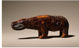
Title: Polar Bear Effigy Date: A.D. 100-600 Primary Maker: Ipiutak Medium: Walrus ivory