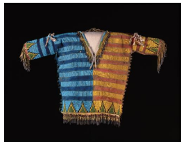
Title: Shirt Date: c. 1870 Primary Maker: Blackfeet Medium: Buffalo hide, pigment, porcupine quills, tin cones, glass and gourd beads, rabbit fur