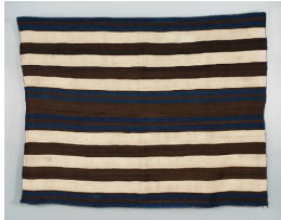
Title: Blanket Date: 1840-1860 Primary Maker: Dine (Navajo) Medium: Wool, white (natural), wool, indigo (dyed), Wool, brown (natural), wool, brown, brown enhanced with Diné organic black dye