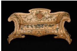
Title: Miniature Settee Date: c. 1830 Primary Maker: Wendat (Huron) Medium: Birchbark, moosehair, dye