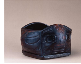
Title: Bent-Corner Dish Date: 1750-1800 Primary Maker: Tlingit or Tsimshian Medium: Yew, red cedar, fiber cordage