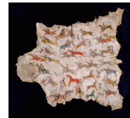
Title: War Record Date: c. 1880 Primary Maker: Lakota (Teton Sioux) Medium: Hide, pigments