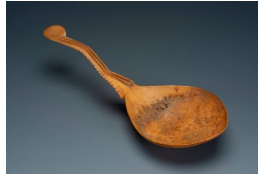
Title: Spoon Date: c. 1900 Primary Maker: Yurok Medium: Elk antler horn