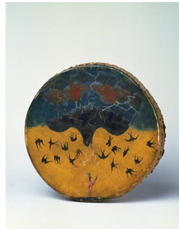
Title: Drum Date: c. 1890 Primary Maker: George Beaver Medium: Rawhide, wood, blue, pigments, iron nails, tacks, pigments