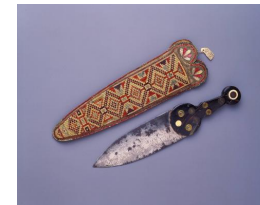
Title: Knife and Sheath Date: c. 1830 Primary Maker: Anishinaabe (Red River Ojibwa) Medium: Knife: steel, African buffalo horn, brass and bone fittings, Sheath: hide, porcupine quills, sinew