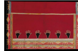
Title: Blanket Date: c. 1890 Primary Maker: Wah-zah-zhe (Osage) Medium: Wool, silk ribbons, beads, thread