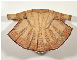
Title: Coat Date: 1785-1800 Primary Maker: Innu (Naskapi) Medium: Caribou skin, pigments, sinew thread