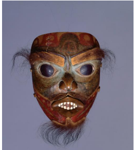
Title: Mask Date: 1800-1840 Primary Maker: Tlingit Medium: Alder, copper, red turban snail opercula, bear skin, leather, paint