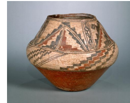
Title: Jar Date: c. 1750 Primary Maker: Ashiwi (Zuni) Medium: Clay, pigment