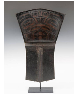
Title: Copper Date: c. 1840-1860 Primary Maker: Haida or Tsimshian Medium: Copper sheet, paint