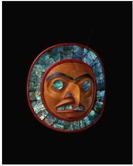
Title: Frontlet Date: 1840-1870 Primary Maker: Coast Tsimshian Medium: Maple, abalone shell, paint, native copper repair on back, twine, string