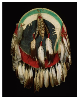
Title: Shield Date: c. 1860 Primary Maker: Apsaalooke (Crow) Medium: Buffalo rawhide, antelope skin, porcupine quills, eagle and hawk feathers, trade cloth, pigments