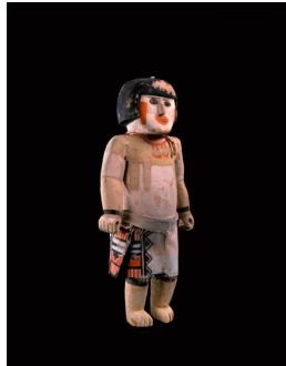
Title: Piptuka Wutaka Date: 1910-1920 Primary Maker: Hopi Medium: Wood, gesso, paint, linen or cotton cloth, wire nails, string