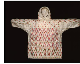
Title: Parka (Qas'peq) Date: c. 1890-1910 Primary Maker: Central Yup'ik Medium: Seal intestine, sinew, animal hide, walrus fur, polar bear fur, thread, aniline dyes