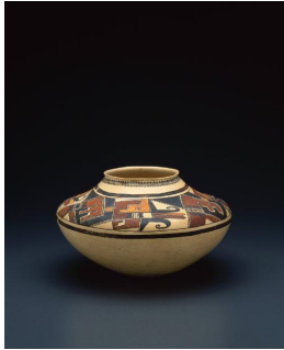
Title: Jar Date: c. 1450-1500 Primary Maker: Sikyatki Medium: Clay, pigment