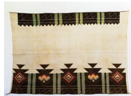
Title: Manta Date: 1915-1935 Primary Maker: Hopi Medium: Wool, cotton, dyes