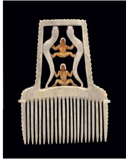
Title: Comb Date: c. 1989 Primary Maker: Stan Hill Medium: Moose antler