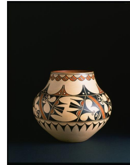
Title: Jar Date: c. 1925 Primary Maker: Maria Martinez Medium: Clay, pigment