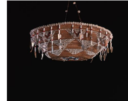
Title: Basket Date: 1830-1860 Primary Maker: Pomo Medium: Willow rod, salix, sedge root, carex, cotton twine, white pony beads, abalone shell pendants, clamshell disc beads, hemp, red white-heart and green-heart carnelian beads, blue and green beads, woodpecker feathers