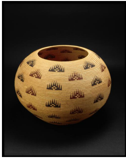
Title: Beacon Lights Date: 1904-1905 Primary Maker: Louisa Keyser (Datsolalee) Medium: Willow, salix, western redbud, cercis occidentalis, bracken fern root, pteridium aquilinum