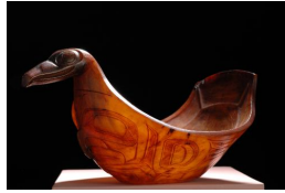
Title: Dish Date: 1840-1860 Primary Maker: Haida Medium: Dall sheep horn