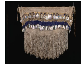
Title: Dance Skirt Date: c. 1875 Primary Maker: Hupa Medium: Deer hide, glass beads, trade beads, abalone shells, maidenhair fern, bear grass, cloth ties added at a later date