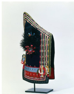
Title: Cap Date: 1847-1854 Primary Maker: Mi'kmaq (Micmac) Medium: Tradecloth, silk ribbons and trim, dyed ostrich feathers, glass beads