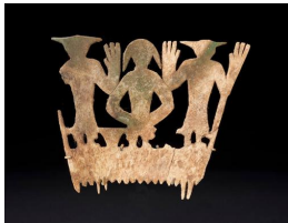
Title: Comb Date: 1670-1687 Primary Maker: Seneca (Haudenosaunee) Medium: Moose or elk antler